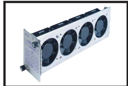
M4-AIR. Fan module (included with chassis), has 4 redundant fans with fault notification